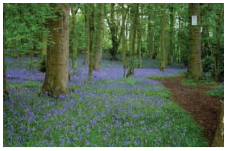
Research, such as the genetic research on the threat to native bluebells (Hyacinthoides non-scripta) from the Spanish bluebell (Hyacinthoides hispanica), is vital for informing both policy and practice on non-native species.