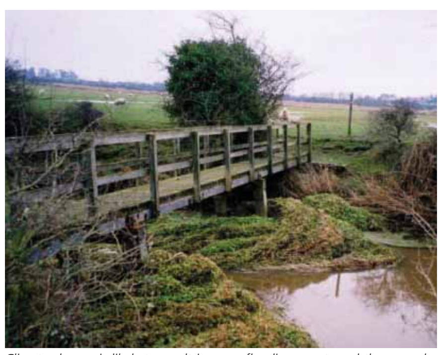
research also shows that Climate change is likely to result in more flooding events and these can be the (generally northerly) greatly exacerbated by invasive plants choking waterways.

1.6 Climate change will have a substantial impact biodiversity in the coming years – both by affecting the distribution of our native species, and by enabling some non-native species to become more common. Increasingly we could also see more non-native species that are currently benign become invasive as the climate changes. Already we are seeing some evidence of animals occurring outside their usual or expected ranges. Recent expanding range of some