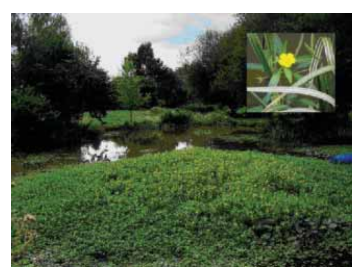
The water primrose (Ludwigia peploides/grandiflora) is a South American species that has become highly invasive in France. There is currently research being carried out in Britain to see how best we can eradicate the few wild populations here before it becomes a serious problem.