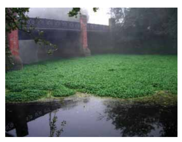
Banning the sale of highly invasive species such as floating pennywort is possible under existing legislation.

widely outside the traditional concerns of threats to agriculture and horticulture from plant pests and diseases. This would reap the benefits of an existing infrastructure and national network.