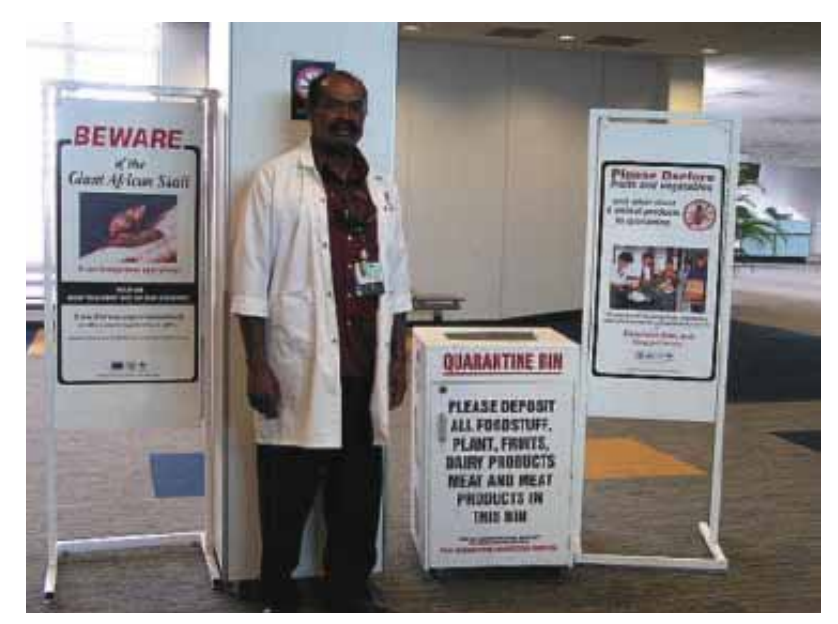
Discouraging travellers from bringing unwanted products into the country can be an efficient and cost-effective way of preventing invasive species entering the country.