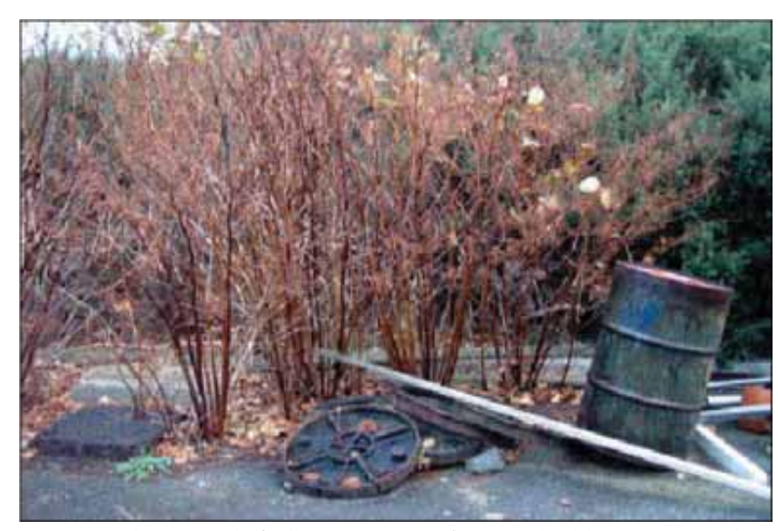
Japanese knotweed (Fallopia japonica) is a highly invasive plant introduced to Britain in the mid Nineteenth Century. It is extremely difficult to remove and costs the development industry millions of pounds per annum.

document. A key finding was that responsibilities and action in respect of non-native species were lacking sufficient co-ordination and strategic direction; and this resulted in a general failure within Great Britain to make optimum use existing capacity resources to address impact of invasive non-native species biodiversity. on This lack of a clear strategic framework was further confirmed in the context of subsequent research into the spread of responsibilities concerning non-native species the aovernments. their various related bodies and local government.