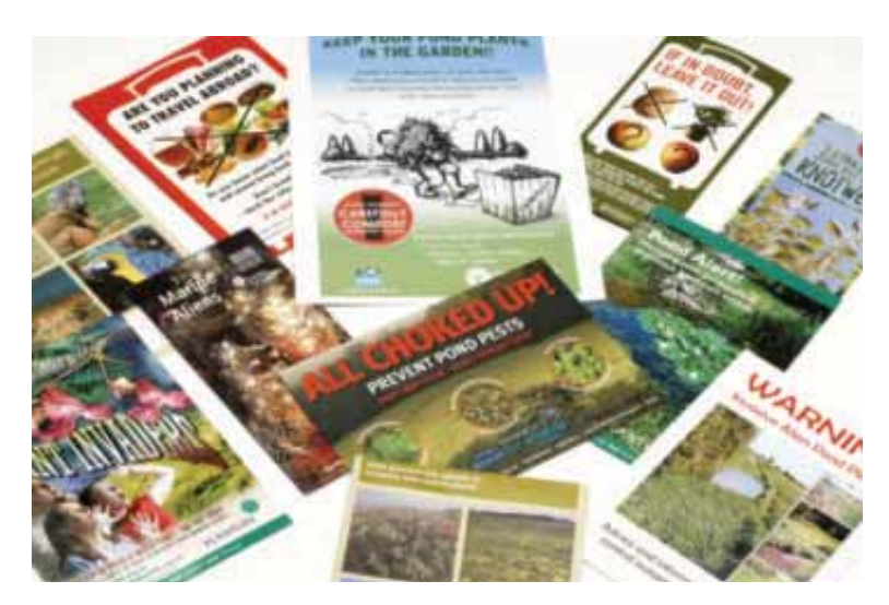
Visually attractive information leaflets are a tool that is commonly used to help raise public awareness about the risks posed by non-native species.

9.3 It is important to monitor public attitudes to ensure that any action to raise awareness and encourage participation is having the desired effect. This will enable some measurement of the effectiveness and value for money of the measures employed. The collection of baseline information on current public awareness and understanding of non-native species issues is a key first step against which to measure future changes in attitude and perception.