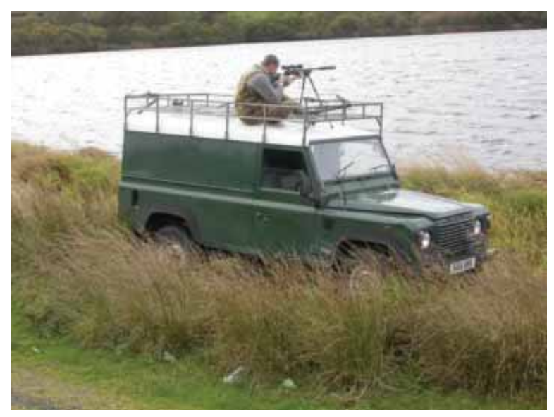
The Defra and EU LIFE funded Ruddy Duck eradication project is the largest project of its kind in Europe.