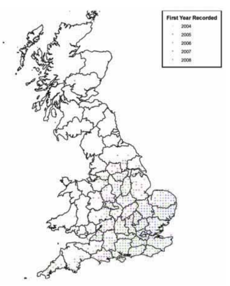
Map shows spread by first year recorded for each 10km square for the Harlequin ladybird ( Harmonia axyridis ). [www.harlequin-survey.org]. Access to up-to-date information on the distribution of non-native species is very important for underpinning policy decisions.